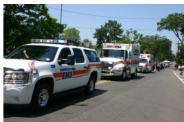
You deserve Emergency Services in Your Neighborhood

Norwood EMS is the all volunteer agency that provides emergency medical services to Norwood. Our members are NJ Certified EMTs. Our vehicles include two ambulances, First Responder, Special Operations Vehicle, trailer and an EMS equipped bicycle. Our funding comes from a combination of tax dollars and donations from our residents and businesses.