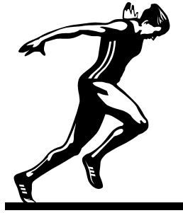
Norwood 5K Charity Run, Saturday, October 22, 2011

October 22, 2011 with an official race start of 9:30 a.m. Pre-register online or via race applications available at the Norwood Post Office and Borough Hall. All additional information can be found at www.facebook.com/fastandflat . Come support a very worthy cause with this year's proceeds benefitting the Norwood PTO, the American Heart Association, The Salvation Army and more.