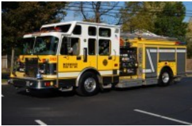
Congratulations on 100 years of dedicated service to the Borough of Norwood

We are planning to complete work this fall to delineate the boundary and landscape improvements to the historic cemetery located on Meadow Lane. The town took legal possession of this cemetery a few years ago. Thanks to the tireless work of the Historic Preservation Committee and the residents we expect to see this project completed in a way that will be respectful to our geographical ancestors who are buried there.