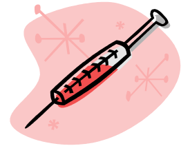
Flu Shots, Wednesday, November 16 from 2:00 to 3:00 p.m.

The Norwood Board of Health is here to serve you. They are committed to maintaining the well being of the residents. If there are any questions or concerns or if health information is needed, please feel free to contact the Board of Health at 201-767-7204.