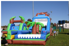
Come have some fun! Saturday, September 24 from 2-6PM. Rain date, Sunday, September 25.